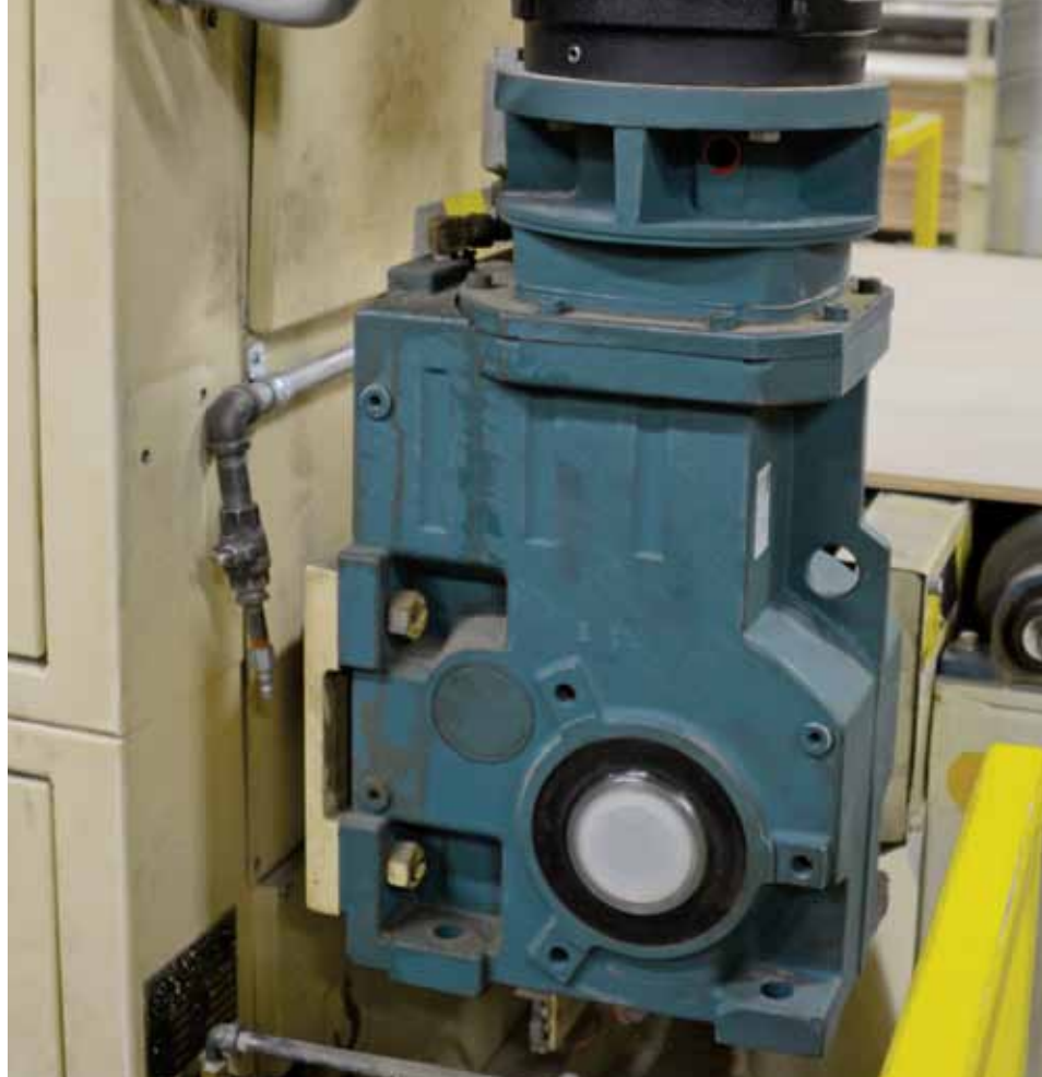
This size 108 RHB Quantis reducer replaced a competitor's gearbox so operators can better control the speed of the transfer belts on a sanding machine. Some wood panels need to be sanded quickly while others need to be sanded more slowly. With the Quantis gearbox installed, operators can now utilize the full speed range of the sander.