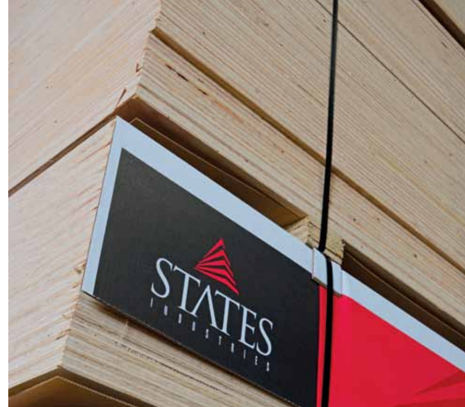
States Industries LLC, founded in Eugene, Oregon in 1966, is a premier manufacturer of hardwood plywood and specialty panel products. Its primary manufacturing facility has the capacity to manufacture 300,000 panels per month and includes three multi-opening presses, two sanding lines, a sizing sander and the industry's most comprehensive finishing lines.

What was even more impressive, according to Stevens, is that the gearboxes he ordered were not standard, off-the-shelf products, each of them was built to his exact specifications.