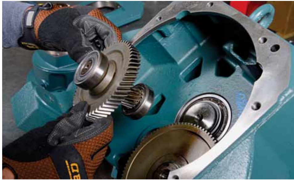
With a large inventory of preselected components, trained technicians at Baldor's Dodge Quantis Build Center in Reno can build gearboxes with an extensive variety of power ratings, ratios and shaft configurations.

With a large inventory of preselected components, trained technicians can build gearboxes with an extensive variety of power ratings, ratios and shaft configurations.