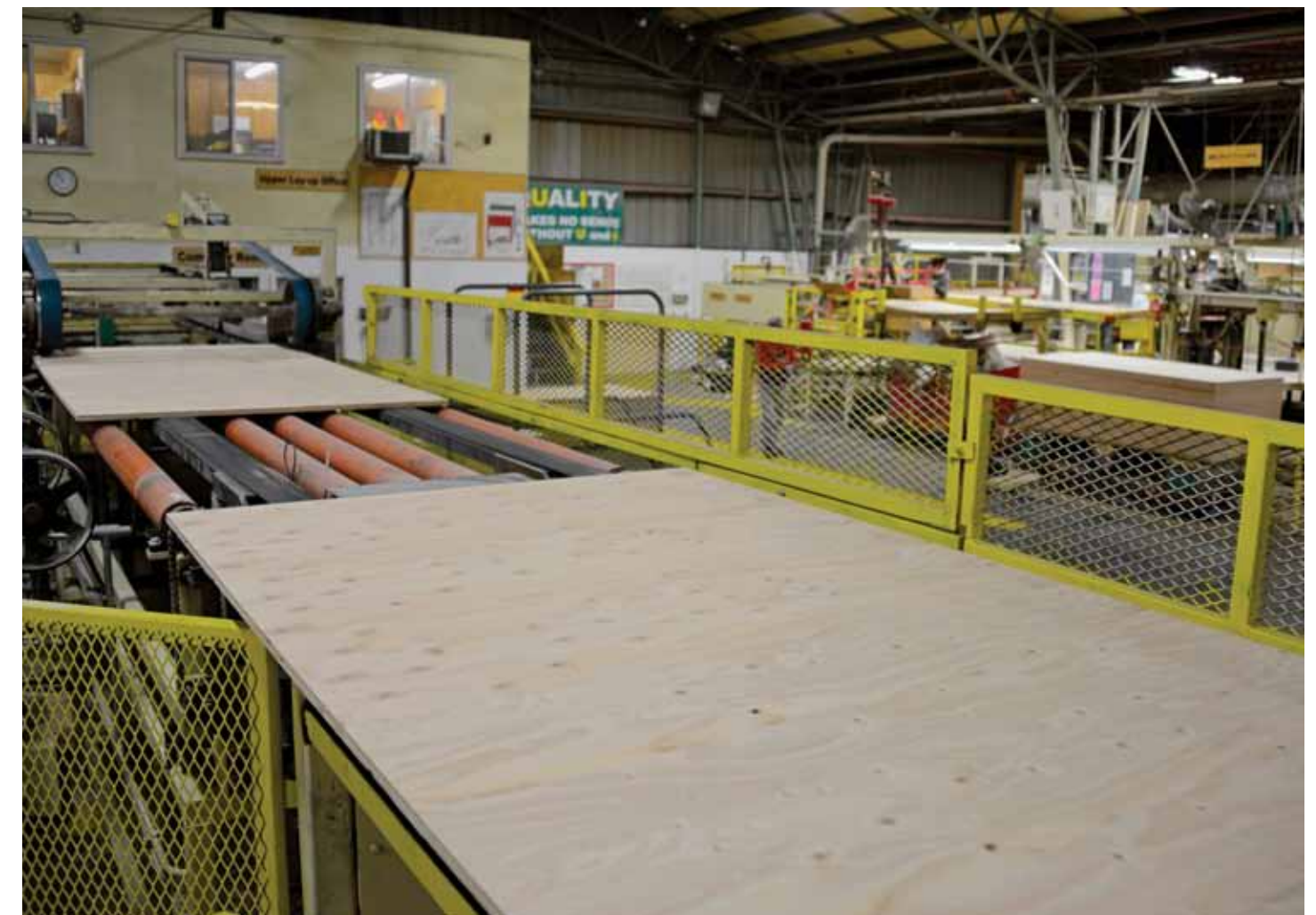
Baldor's Dodge Quantis reducers help power the newly built equipment that ties the poly line, the panel turner and the sanding line into one continuous process.